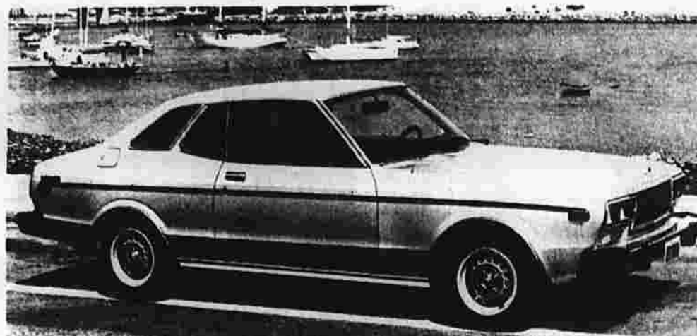
The 1979 Datsun 810 two-door hardtop is the latest addition to the complete line of Datsun automobiles. The new coupe joins the other