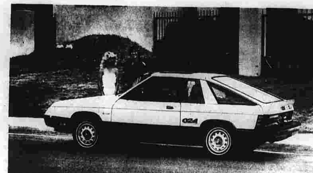
1979 Dodge Omni 024 Hatchback

Main Office: 1007 Main St., Manchester 649-4288 • K-Main Office: Spencer St., Manchester 648-2022 • Coventry Office: Rt. 31, 743-7331 • Tolland Office: Rt. 195, 1 mile south of I-80, Exit 96, 872-7387 • Money markets inside U-Save, E. Middle Turnpike, Manchester, and Food Mart, W. Middle Turnpike in the Manchester Parkade