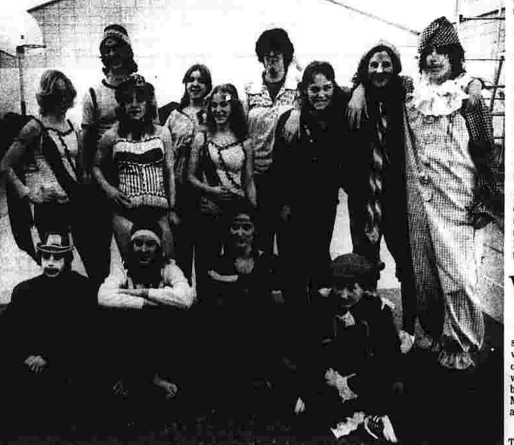
Rockville Valentine Party