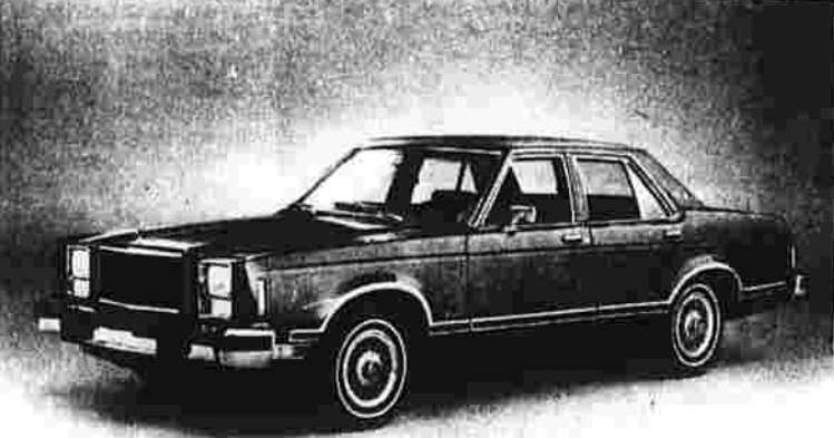
1979 Mercury Monarch