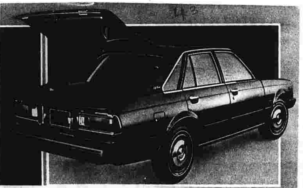
The Toyota Corona liftback offers the new carrying capacity of a station wagon. The car buyer a compromise. It combines the Corona series is powered by an economical 2.2 liter four-cylinder engine.