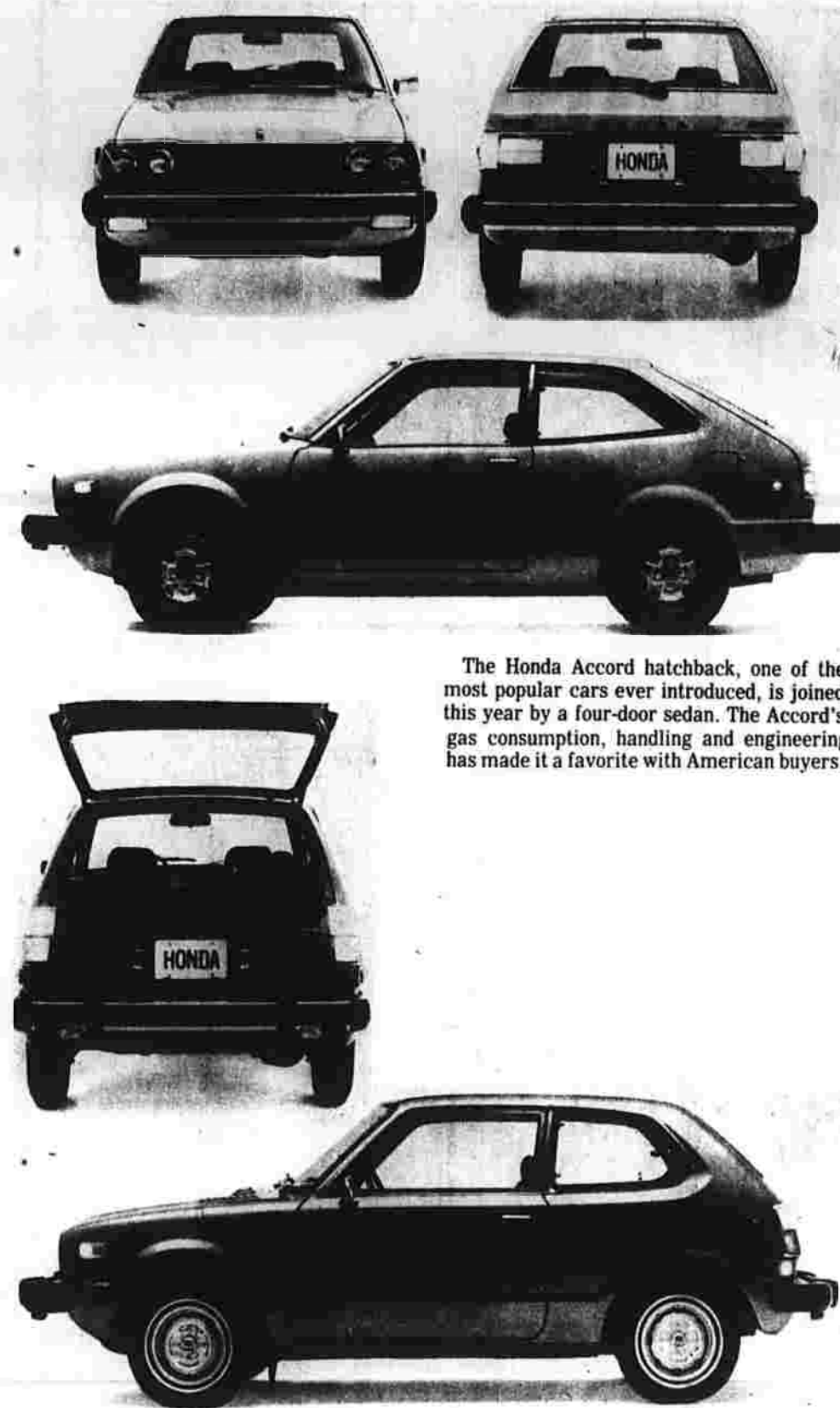
The Honda Accord hatchback, one of the most popular cars ever introduced, is joined this year by a four-door sedan. The Accord's gas consumption, handling and engineering has made it a favorite with American buyers.