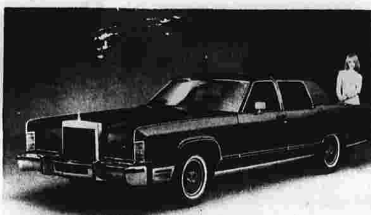
1979 Lincoln Continental

brake service chains an excellent growth opportunity. The small independent mechanical shop also can do well if the proprietor is a good craftsman and a good businessman. However, the average motorist may have an easier time finding the nearest reputable chain transmission repair service than a dependable independent mechanic. Midas, which is about 22 years old, is one of the pioneers in the franchised chain auto service shops. It installs brakes and shock absorbers as well as mufflers. Ninety-five percent of its 1,100 shops are independent franchises, many of which also provide other services. Rayco, founded to sell seat covers in the days before the new long-lasting vinyl and fabric upholstery, probably is the oldest firm in the chain service shop business, de Camara said. Midas has $150 million a year in muffler, brake and shock absorber sales, and de Camara is getting new franchised muffler shops opened at the rate of 100 a year. Competitively, he still has a big market to nibble at because sales of mufflers, tailpipes and other exhaust products run to $2.4 billion a year. De Camara is banking heavily on the high profit appeal of independent franchising for growth. One of his biggest competitors, Tenco's Walker Manufacturing Co. and its Speedy Muffler chain, is company owned. De Camara said the ability to give fast, traditional service centers gives firms like Midas, Rayco, Speedy Muffler and the various automotive transmission and service chains.