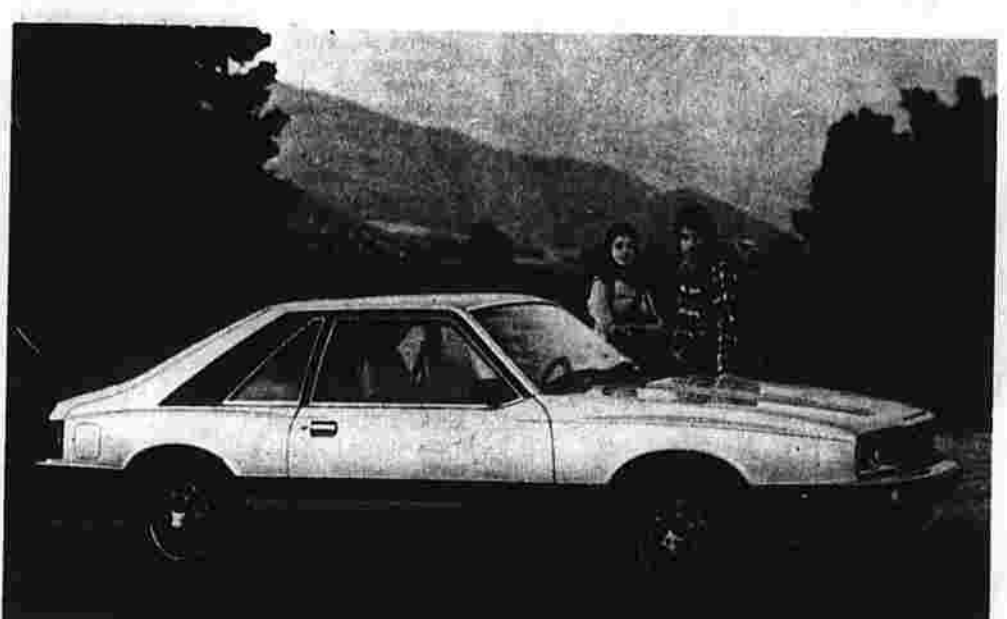
1979 Mercury Capri