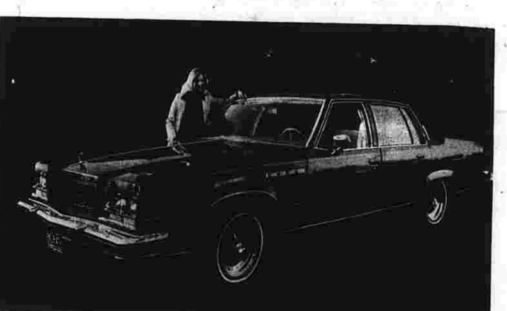
1979 Buick Electra Park Avenue Sedan