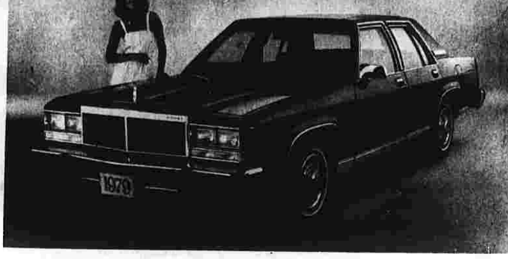
All-New Ford LTD

The standard power train for the Granada is a six-cylinder engine and a new four-speed overdrive manual transmission. The LTD II models for 1979 include a two-door hardtop and four-door LTD II and the LTD II Brougham. The 1979 Ford truck line still offers a full range of models including four-wheel drives, club cabs and the popular Ford Bronco redesigned last year.