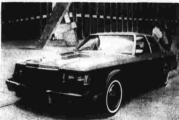
1979 Dodge ST Regis