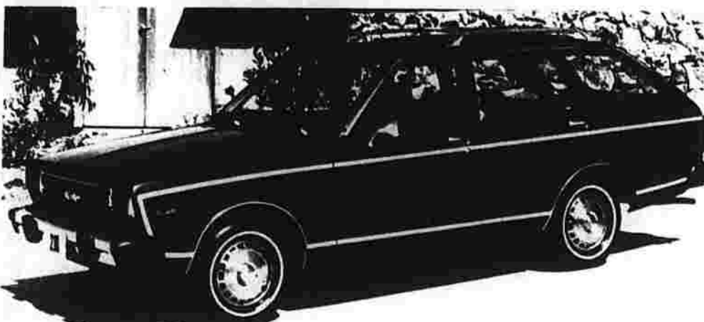
The 1979 Datsun 210 series station wagon, is the first station wagon Datsun has offered in its lowest price line. The new station wagon combines versatility with exceptional gas consumption.