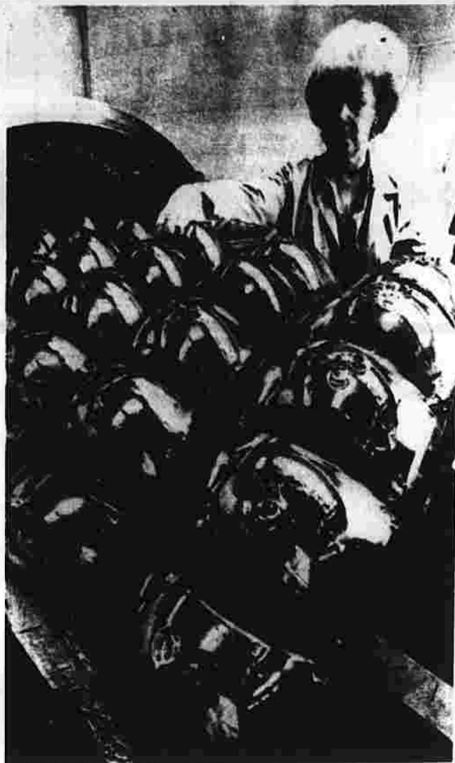
These glass reflectors have just received an aluminum coating in a vacuum furnace. The units are used to assemble Sylvania halogen sealed-beam headlamps produced at a GTE Lighting Group pilot plant in Salem, Mass., for Ford Motor Co. cars.