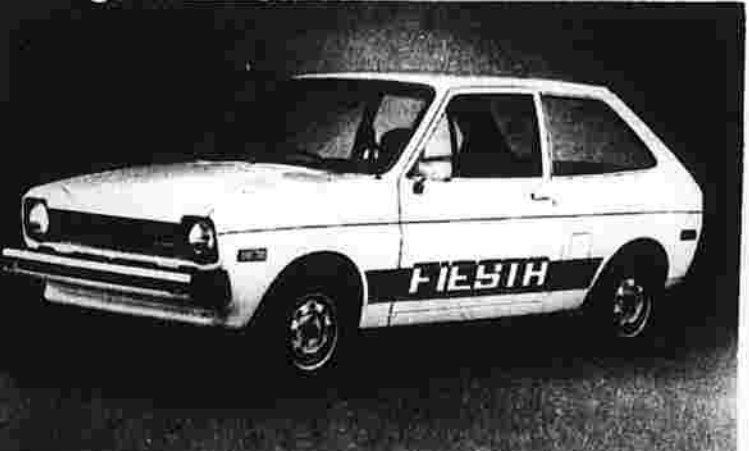
1979 Ford Fiesta