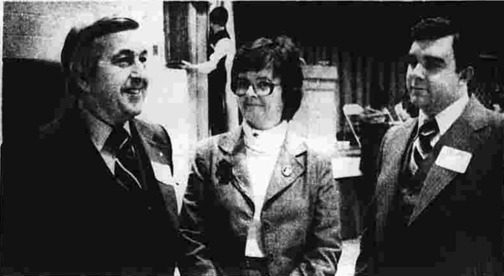
Cheney Tech Open House