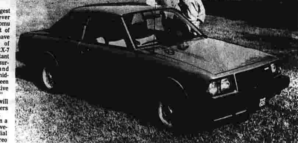
The Mazda 626 sports coupe will be introduced at Mazda dealers later this month. The piston-engine series is the latest addition to the Mazda line which is making a strong comeback in the American automotive market.

Powered by a four cylinder engine, the GLC has a four-speed transmission, with a five-speed available as an option or on the deluxe models. An automatic transmission is available as an option. Economy as well as creature comfort has been the selling point of the small, front-engine, rear-drive car. Although small in size, the GLC offers a great amount of passenger room and cargo carrying capacity in all models. The second reason for Mazda's increased sales during the past year, is the RX-7 sports coupe, the only rotary-powered sports coupe available in the United States. Fuel economy of the rotary engine has been improved and the RX-7 offers the discerning buyer a true sports car with innovative and practical engineering. Offered as a two-door coupe only, the RX-7 has become the fastest-selling sports coupe in the country and has been well-received by the automotive press and the serious driver. The RX-7's aerodynamically designed body, coupled with the rotary engine and a standard four-speed transmission is a true sports car and offers the ultimate in handling and performance while still being economical to operate. A five-speed transmission is available on the deluxe models. Mazda is continuing its onslaught on the American market with two new models to be introduced later this month. The 626 series will be offered in a sedan and sports coupe and will offer the American motoring public a mid-size automobile with conventional piston engine power.